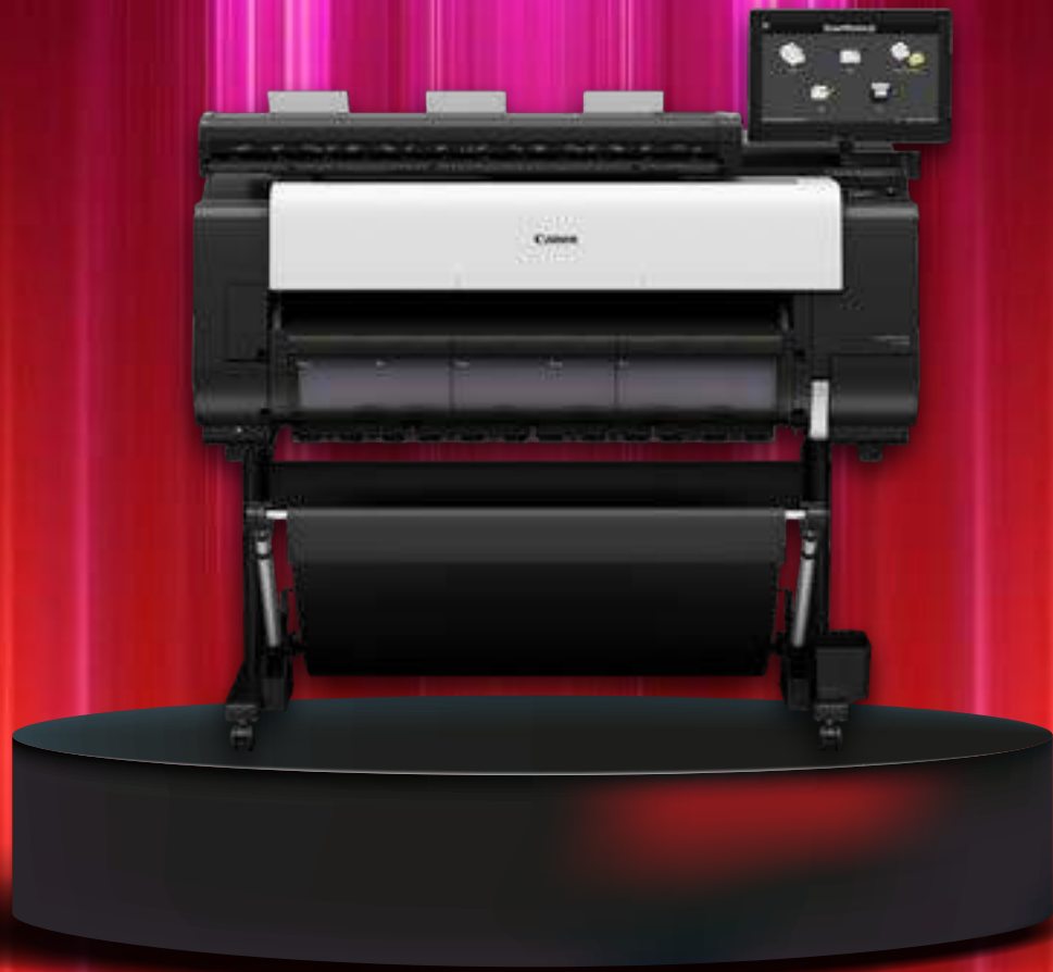
imagePROGRAF TX-3200 MFP Z36